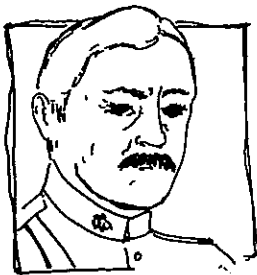
JOHN J. PERSHING: A GREAT AMERICAN GENERAL

If you answered with sentences 2 and 4, you are correct. Sentences 1 and 3 have little to do with the hypothesis. Read the sentences in the next story and pick out those that deal directly with the hypothesis.